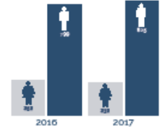
Number of applications received

If you are interested in learning more, please visit our website: cbie.ca 2018 Competition: Information will be posted on the website on September 7, 2017 . Deadline to apply: October 13, 2017 .