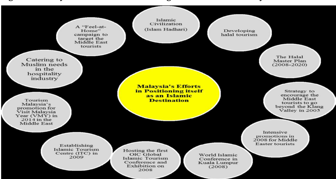
Figure 3. Malaysia's Efforts in Promoting as an Islamic Country