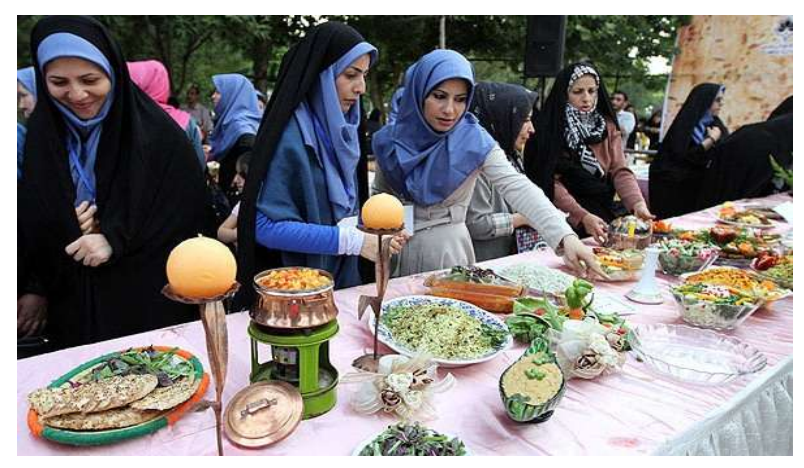
Thus, Malaysia has to enhance the tourism industry in the future in order to remain

Most Arab and Asian Muslim tourists also enjoy modern shopping environments in Malaysia especially for luxury goods. Key challenge facing Malaysia in terms of the MFT market is the growing competition for the same source markets in the region. Malaysia could not rely solely on the current trend of foreign arrivals as factors such as the changing tourists needs and other Asian competitors are among challenges that need to be confronted. The "new tourism" is beginning to take up the demand characteristics such as quality products and experience, free and independent travelers (FIT) as opposed to mass tourism, use of new technologies in information seeking and distribution, maximize yield not volume, environmental concern and protection and direct marketing.